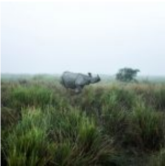
Kaziranga Reserve, Assam