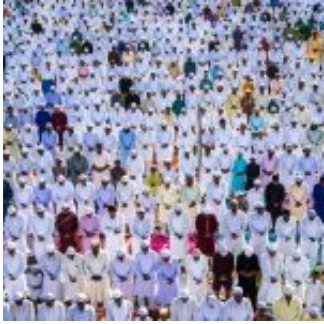
Eid, Indo-Bangladesh border