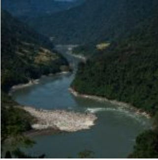
Siang, Arunachal Pradesh