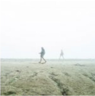
Winter Morning, Assam