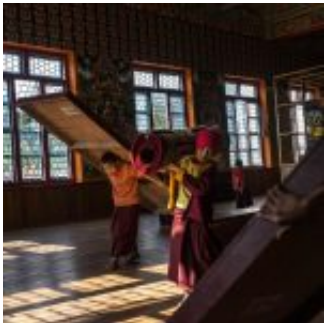
Tuting Monestary, Arunachal Pradesh