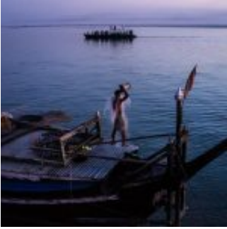
Majuli Island, Assam