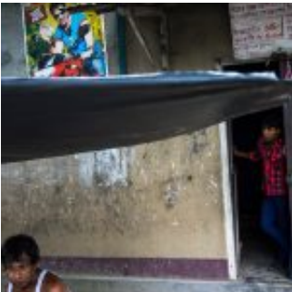
Video theatre, India-Bangladesh border