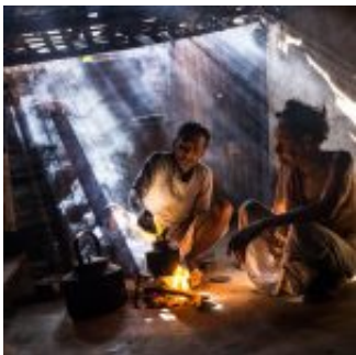
Dakhinpat Satra, Majuli Islands