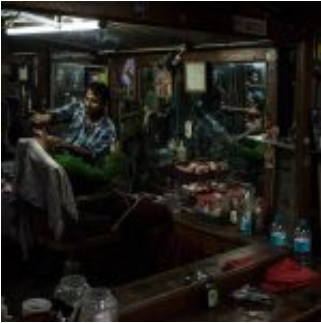
Barber shop, Assam