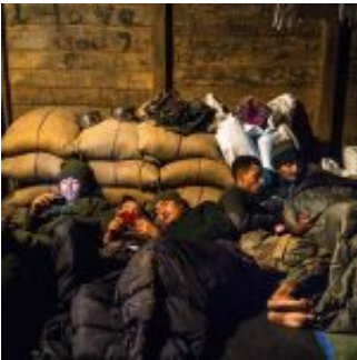
Indian Army – Indo-China Border