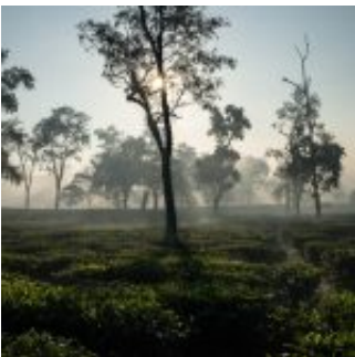
Tea gardens, Upper Assam