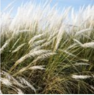
Bangladesh Border, Assam