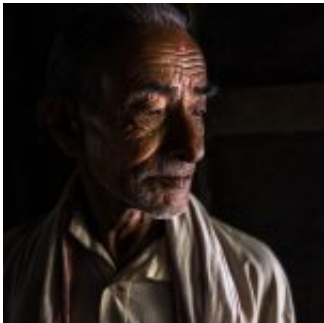
Monk, Majuli island