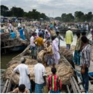
Jute Market, Dhubri