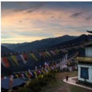
Yortung, Arunachal Pradesh

Here's the first part of this on-going series.