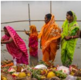
Brahmaputra River, Assam